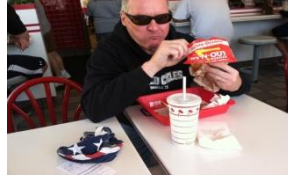
In & Out Burgers