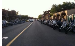
Old Town Temecula Ca.