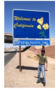
on the border !