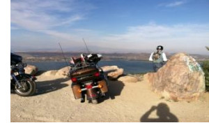
View from Ortega Hwy.