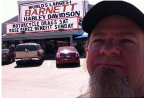
Barnetts in El Paso