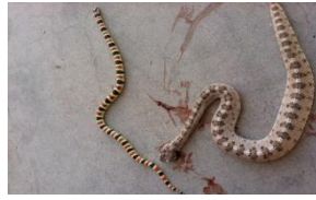
our new friends